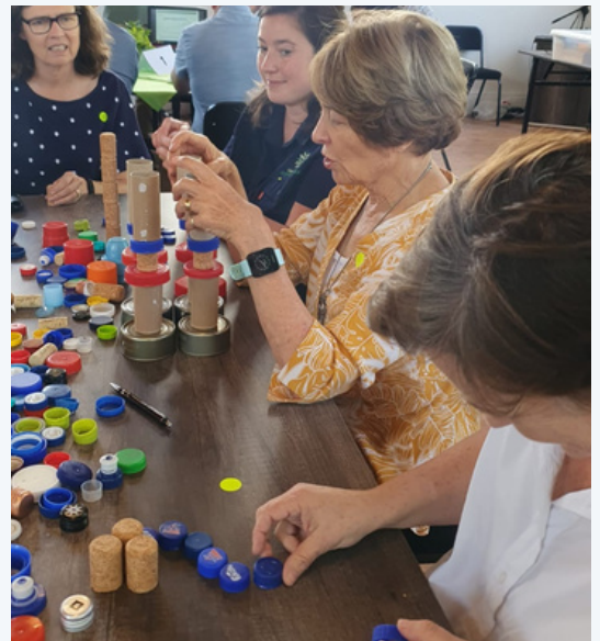
A playful moment showcasing Little Seeds's services at the #integritas conference - November 2022