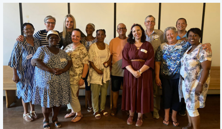
An ECD-meeting between the church councils of N.G kerk Laingsburg and URCSA Laingsburg