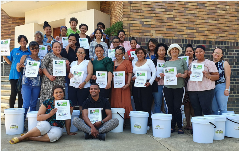
Storytellers in Citrusdal - November 2022

We love what we do and have fun while doing it!