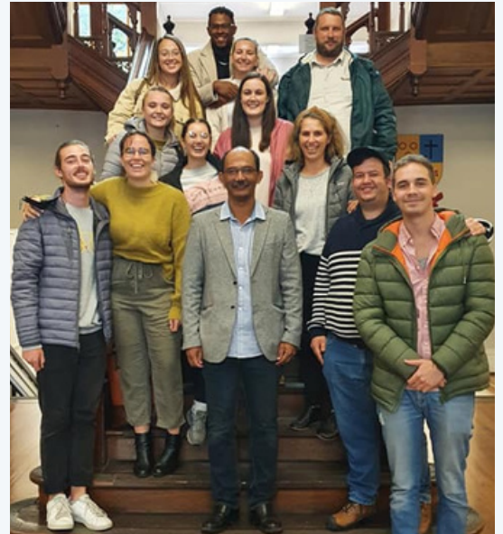
Raising awareness with the 2022 final year theology students at University Stellenbosch