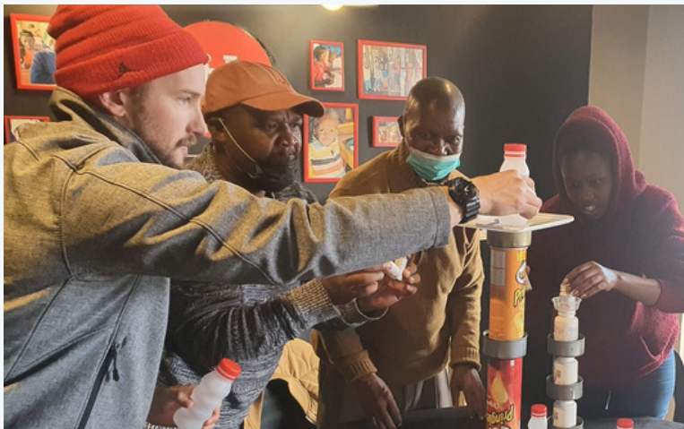
Value of Play-workshop presented to an international visitors and local pastors at Orchard: Africa in Somerset West - June 2022