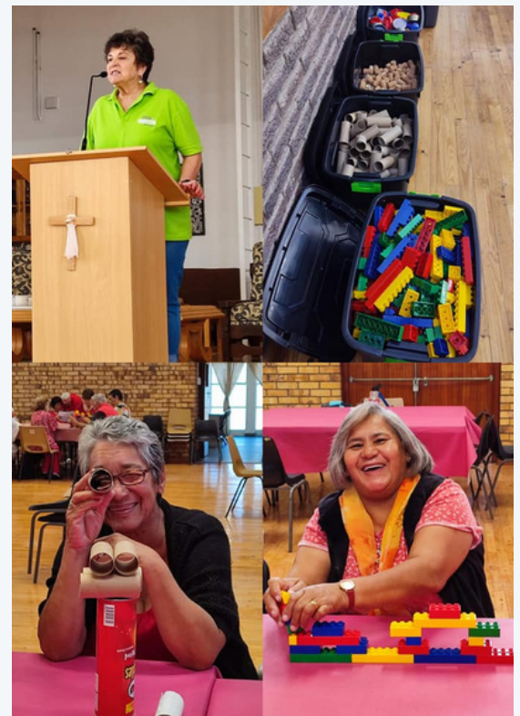
Training at Ruyterwacht Senior Centre

Target groups - including the elderly at Ruyterwacht Service Centre, educators and parents - who attended the information sessions were equipped with skills and knowledge of the building blocks and importance of early childhood development as well as skills pertaining to reading, storytelling and playing with children to stimulate their development.