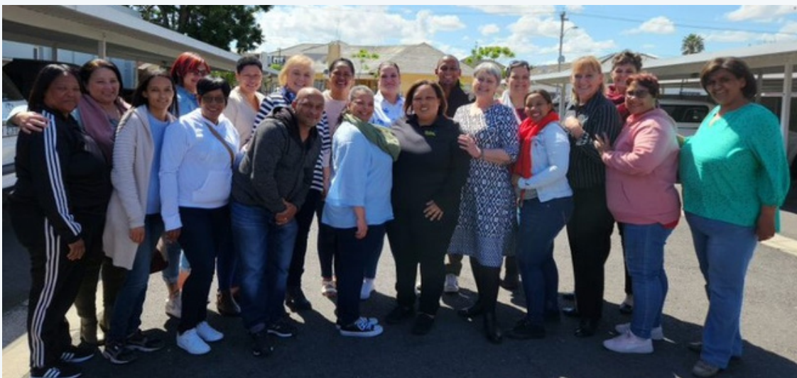
Day Care programme managers at Little Seeds' office in Bellville

This report will give you a peek into our challenges and success stories over the reporting period. We share it with thankfulness and a strong belief Little Seeds will grow into a strong healthy programme that continues to improve the access and quality of Early Learning for our children.