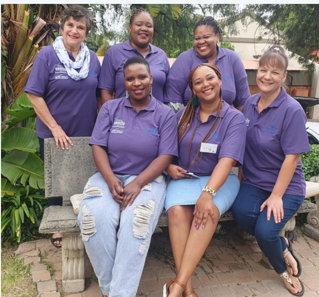
SmartStart Club Coaches and Lead Trainer